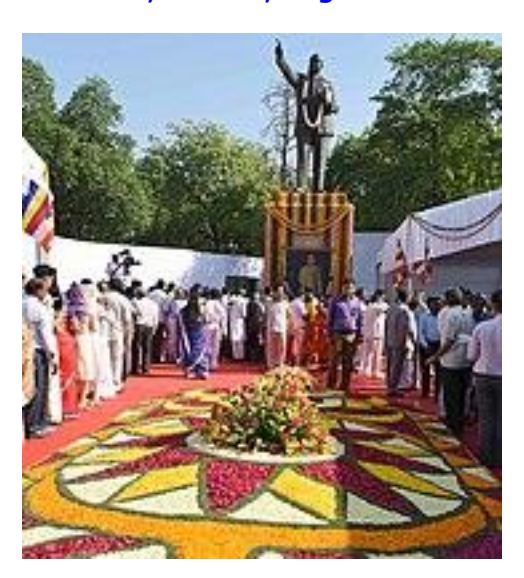
The statue of B. R. Ambedkar in the Parliament of India

In 1930, Ambedkar launched the Kalaram Temple movement after three months of preparation. About 15,000 volunteers assembled at Kalaram Temple satygraha making one of the greatest processions of Nashik. The procession was headed by a military band and a batch of scouts; women and men walked with discipline, order and determination to see the god for the first time. When they reached the gates, the gates were closed by Brahmin authorities.