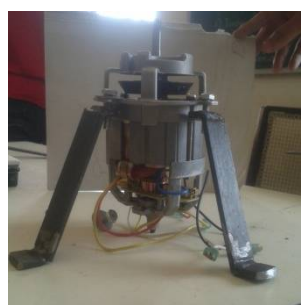
Fig.2. Motor with legs

Fig.2. shows motor, here we have used an AC motor of 750Watts, 230 Volts and 18000 RPM (with no load). And we have used a regulator to control the speed of the blade which is connected to the motor, as required on the amount of raw material to be grinded inside the hopper. The motor is placed on the circular disc with the legs as shown. Motor specification: Ac motor 750 Watts, 230 Volts and 18000rpm, weighs1.8Kg.