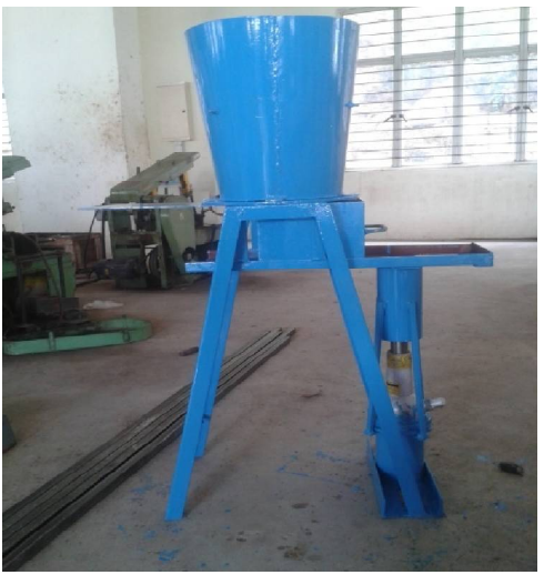
Fig.9. Briquetting Machine

Fig.9. shows the Briquetting machine which can be easily disassembled and hence it is portable. A rigid frame provided for jack supports the whole unit.