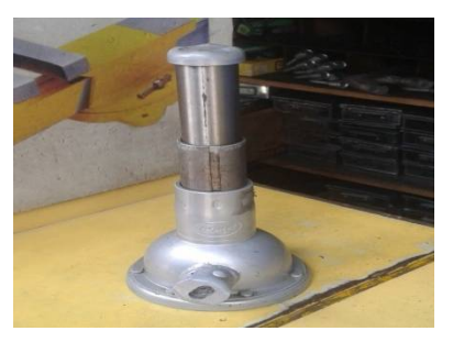
Fig.7. Telescopic jack

Fig.7. shows telescopic jack having 2-ton capacity and the plunger can extrude to maximum of 250mm height. This jack is used to compress the grinded particles in to briquettes.