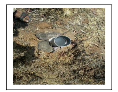
(a)Evaporimeter Installed in Water body and at Ground Surface