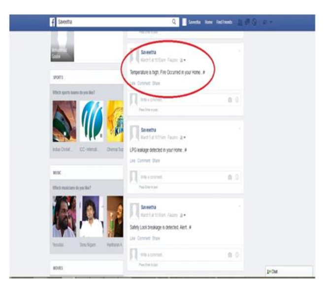
Fig.2: Temperature Detection

If accidentally fire occurred in the user home, when the user is not available, the temperature sensor detects the room temperature continuously. If the temperature of the room is high means i.e. above the normal temperature, it detects and sends the status to the microcontroller. The microcontroller passes the status to the Ethernet gateway via serial communication interface and finally the status is posted on the Facebook. The output screen shot of temperature detection is given below.