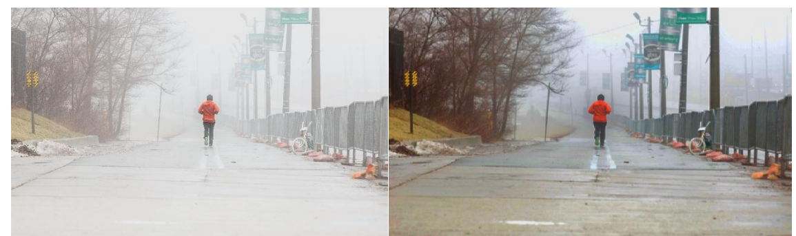
(a) Input foggy image

The above proposed method is applied on the foggy image a: