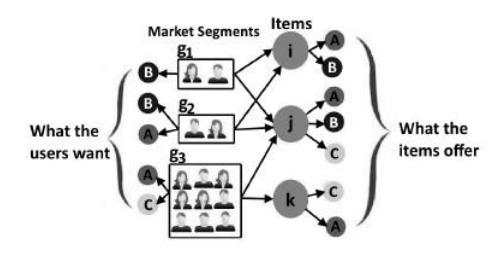
Fig. 1. A (simplified) example of our competitiveness