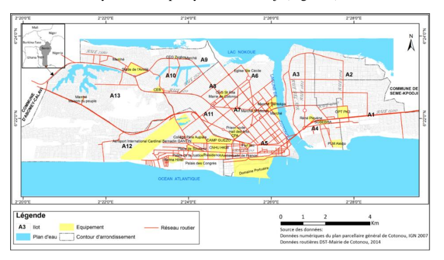
Figure 1: Geographical situation of Cotonou

This study focuses on the two cities with special status of southern Benin, Cotonou and Porto – Novo. Here, emphasis will be laid on the presentation of the geographical situation of each of these cities. The city of Cotonou is situated between the parallels 6 ^{\circ} 21 and 6 ^{\circ} 24 of north latitude and between 2 ^{\circ} 22 and 2 ^{\circ} 30 of east longitude. It is bounded on the north by Nokoué lake, on the south by the Atlantic Ocean, on the west by the communes of Ouidah and Abomey-Calavi, and on the east by the municipality of Sèmè-Podji (Figure 1). [11].