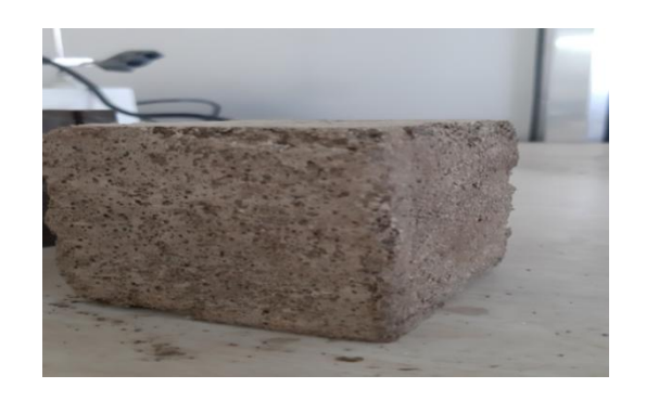
Fig.3 COMPRESSIVE TEST MACHINE CUBE