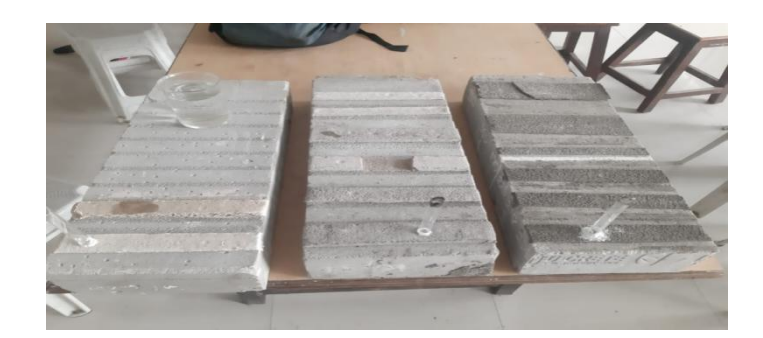
Fig.5 WATER PERMEABILITY