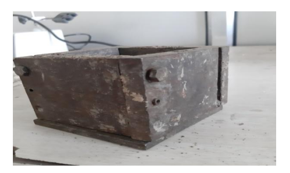
Fig.4 COMPRESSIVE TEST MACHINE CUBE MOULD