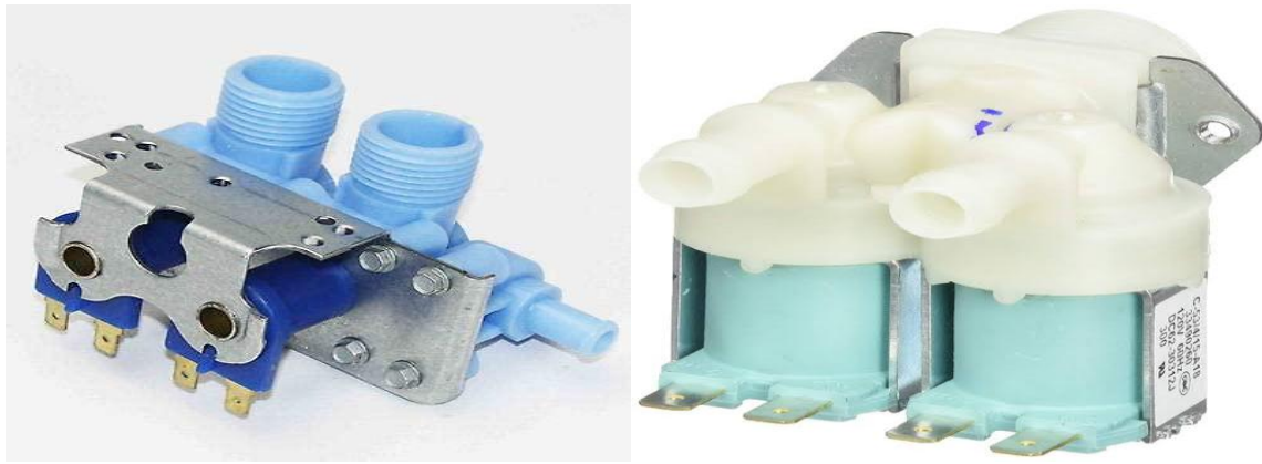
Fig.3 Solenoid Valve

Solenoid valves are the most frequently used control elements in fluidics. Their tasks are to shut off, release, dose, distribute or mix fluids. They are found in many application areas. Solenoids offer fast and safe switching, high reliability, long service life, good medium compatibility of the materials used, low control power and compact design. Domestic washing machines and dishwashers use solenoid valves to control water entry into the machine. They are also often used in paintball gun triggers to actuate the CO_2 hammer valve. Solenoid valves are usually referred to simply as solenoids.