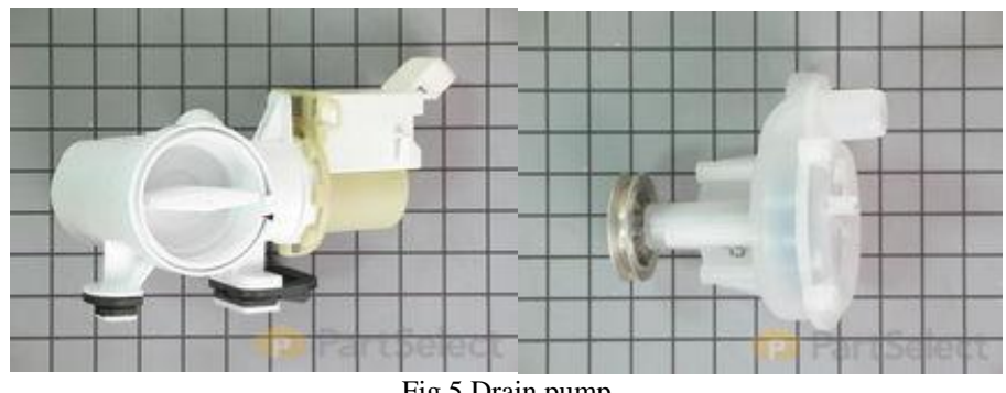
Fig.5 Drain pump

The drain pump removes water from the washing machine tub at the end of the wash and rinse portions of the cycle.