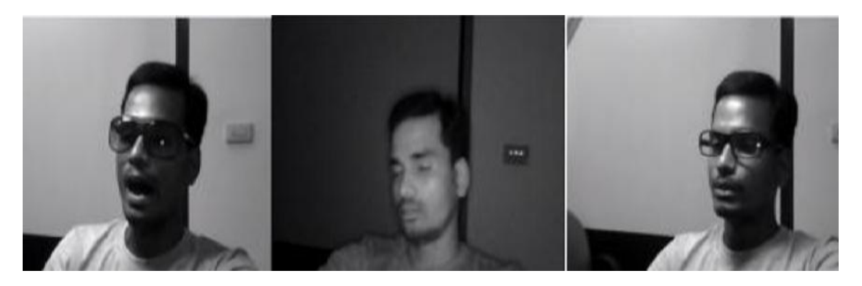
Fig. 2 Drowsy Face detection

The system was able to detect Face from images captured on a camera device and pass it to a CNN-based trained Machine Learning model to detect drowsy driving behavior. The achievement here was the production of a machine learning model that is small in size but relatively high in accuracy.