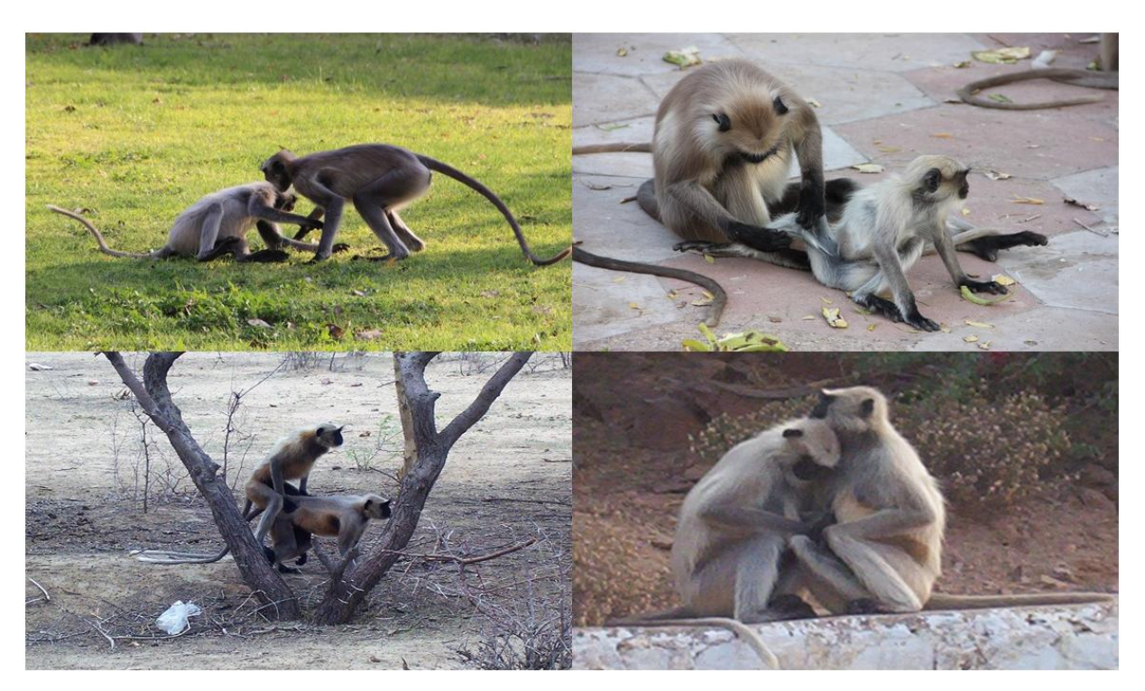
Figure 3: Different behaviour shows by Semnopithecus entellus

Time spent in sexual and other activities was found highest in troop B-04a (03.30%) followed by troop B-06 (02.50%) and troop B-01 (02.30%).