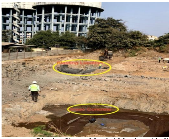
Fig 2: Freshly Poured Concrete near Blasting Sites at Mumbai Mumbra- Airoli Tunnel road work.

3. Measurement of curing characteristics like strength and temperature release of freshly poured concrete/green concrete at vibration exposed zone.