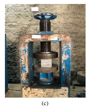
Fig 3: Vibration Monitoring by Engineering Seismograph near the Green Concrete & Concrete Testing Machine(CTM)(a) Mass concrete for pier bed concrete. (b) Sample mold and monitoring near fresh shot create concrete. (c) Cube testing by CTM at project laboratory.