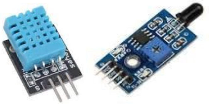
Fig: Temperature sensor

A fire detector is used to detect the smoke or heat. These devices will respond only to the presence of smoke or extremely high temperatures that are present witha fire. A temperature sensor is an electrical device which is used to collect the data about temperature from a particular source and then converts the data into form which is understandable for a device or auser.