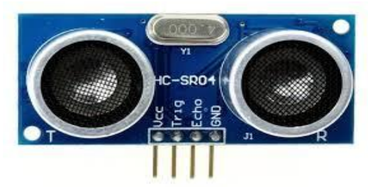
Fig: Ultrasonic sensor

An ultrasonic sensor is a sensor which is used to measure distance to an object using the ultrasonic sound waves. It uses a transducer to send and receive the ultrasonic pulses from the objectwhich relay back information about an object's proximity.