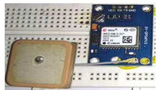
Fig: GPS interfacing with Node MCU

Global Positioning Satellite (GPS) are mostly used in smartphones and in the military to track the location. It uses satellites and the ground stations to find the position on earth. It is also called as navigation system.