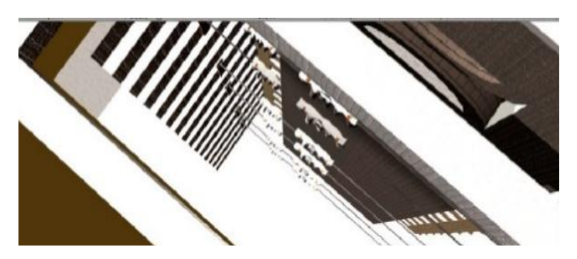
Figure 3. View of player from the building

The treatment for acrophobia is to expose the patients to high places. In this game designer develop three levels of height. First level is the elevator scene where the player is positioned in the balcony of a building. The player can increase the height by pressing the button.