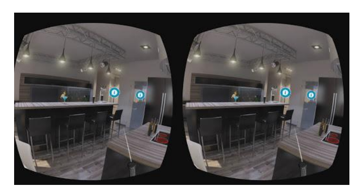
Figure 2. 360° view of VR head gear

image for each eye. The VR environment game without any VR assistance it will be awkward to see because it produce 360° view which cannot be implemented in any other devices.