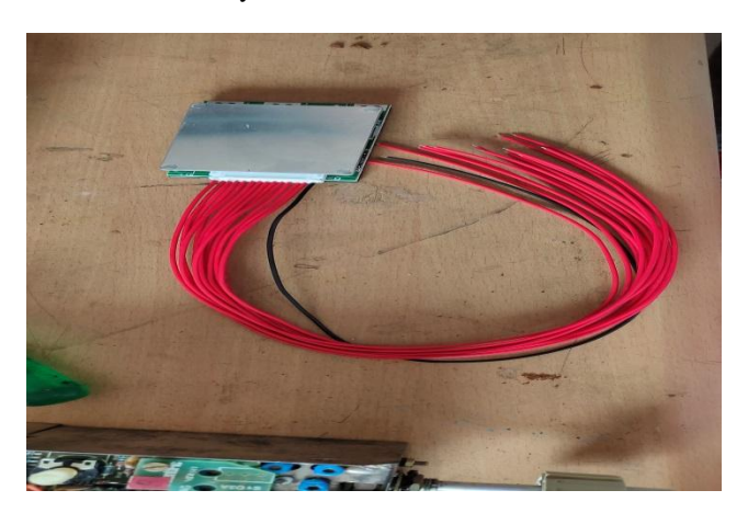
Fig6. Battery management system(BMS)

A battery management system can be comprised of many functional blocks including: cutoff FETs, a fuel gauge monitor, cell voltage monitor, cell voltage balance, real time clock (RTC), temperature monitors and a state machine. There are many types of battery management ICs available. The grouping of the functional blocks varies widely from a simple analog front end that offers balancing and monitoring and requires a microcontroller (MCU), to a standalone, highly integrated solution that runs autonomously.