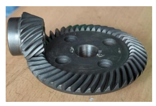
Fig7. Spiral Bevel type assemble