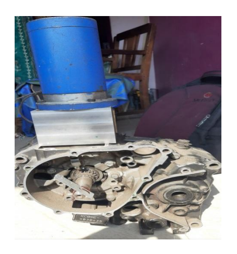
Fig4. BLDC motor