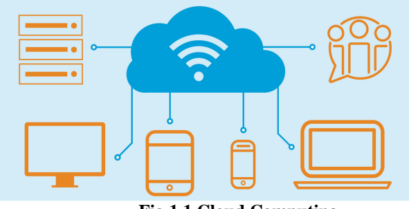
Fig.1.1 Cloud Computing

The availability of high-capacity networks, low-cost computers and storage devices as well as the widespread adoption of hardware virtualization, service-oriented architecture and autonomic and utility of computing which will led to growth of cloud computing. By 2019, Linux was the most widely used operating system, including in Microsoft's offerings and is thus described as dominant.