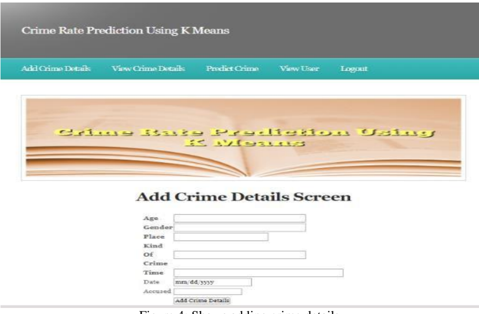
Figure 4: Shows adding crime details