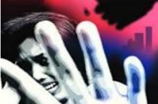
Figure 1: Crime occurrence visualization

Now-a-days the higher crime percentage and fierce crime occurring, there must be some assurance against this crime. Here we presented a framework by which crime percentage can be decreased. Crime information must be taken