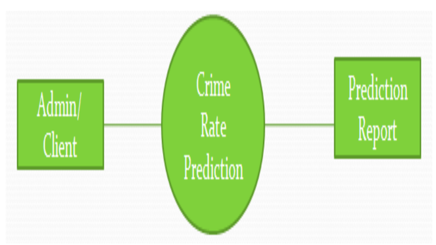
Figure 2: Reference Model of Proposed System

• Profile violations to recognize likenesses and match the wrongdoings to known guilty parties.