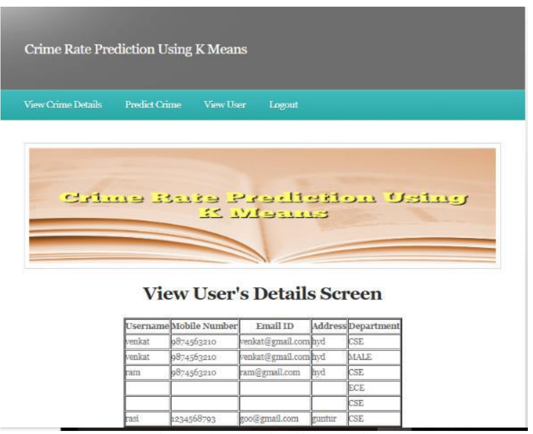
Figure 5: shows the view of users details