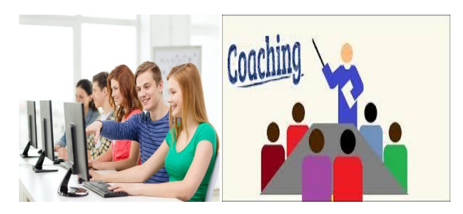
Figure 1: Gaining knowledge through online and manual

In existing system, we can learn subjects and get knowledge by using online education and online videos. We can learn from teaching institutes and tuitions. With the present system we have several problems as shown in figure 1 and some of them are