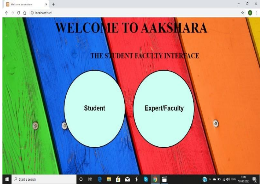
Figure 4: Home Page