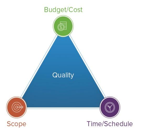
Figure 2: Shows Design Constraints

As in Figure 2 shows our main aim to develop this application is to provide the best and easiest way of learning and gaining knowledge by students with high quality and low cost. To develop this application we also considered time, scope, cost.