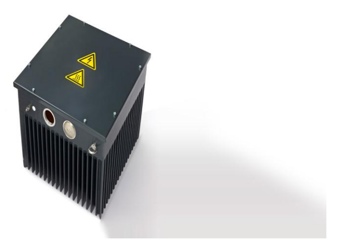
Fig 4: HV Transformer

withstand these motivation voltages, the protection of these transformers must be deliberately structured. These are generally single stage, centre sort transformers