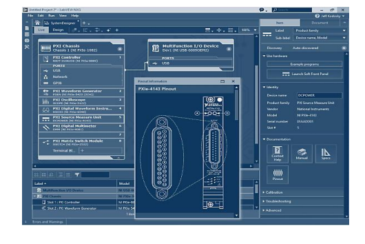
Fig 5: Block Diagram Window

The graphical language is named "G"; not to be mistaken for G-code. Initially discharged for the Apple Macintosh in 1986, Lab-VIEW is generally utilized for information securing, instrument control, and modern mechanization on an assortment of working frameworks (OSs), including Microsoft Windows, different adaptations of Unix, Linux, and macOS. The most recent forms of Lab-VIEW are Lab-VIEW 2019 and Lab-VIEW NXG 3.1, discharged in May 2019.