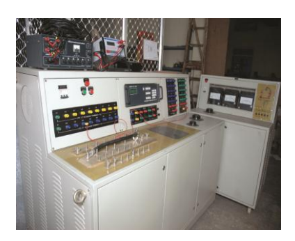
Fig 1: Power Supply Panel Board

Each electrical contraption or machine Is furnished with protection between live part and earth or between two distinct areas of live parts. This protection is required to be tried at high voltage esteems suggested by pertinent significant guidelines.