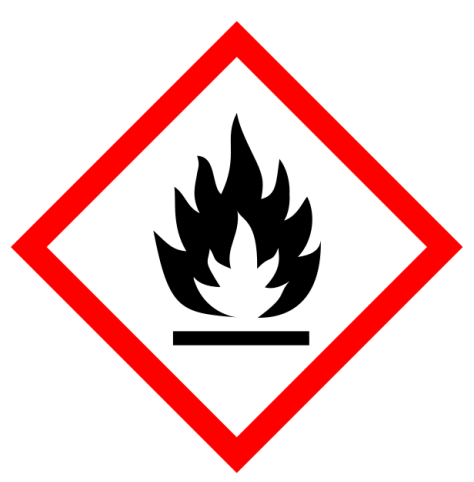
Figure 1a - Flammable symbol