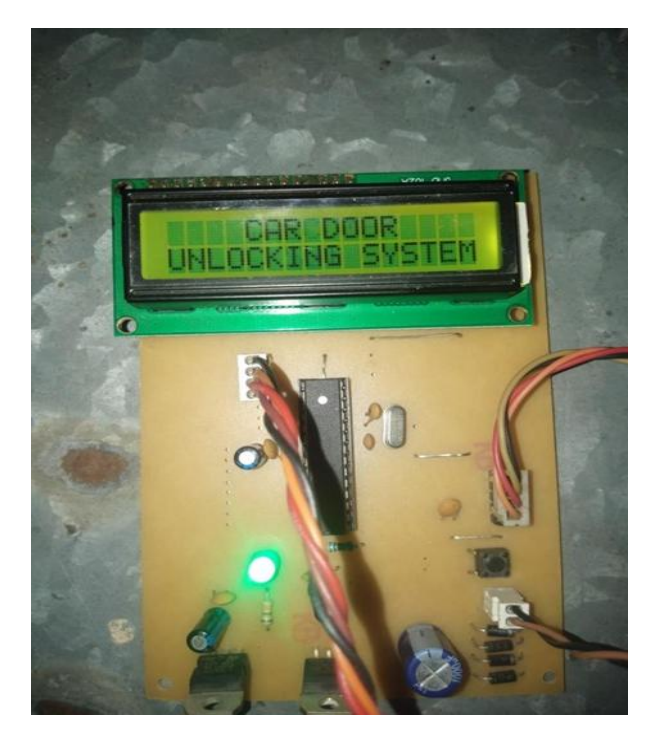
Fig 1.2- LCD Display

This proposed system will help, if we forgot our car keys inside the car, it can make helps to get our car keys back. This system is also provided security if small baby stuck in the car and the car gets locked and baby can't open the door then using this system, we will take out the baby safely outside the car.