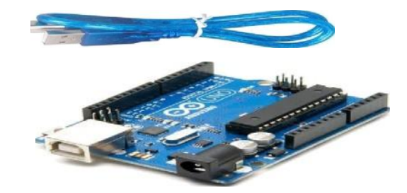
Fig. 3 Uno R3 Atmega328p

This Uno board is a microcontroller based on the ATmega328.