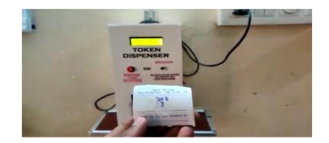
Fig No 1 Hands free token dispenser

Amid the corona virus pandemic, health experts have been emphasising on the importance of keeping the hands germ-free, to ensuring this we have to avoid touching any surface on outside. In this machine we have a thermal printer to print tokens sequentially. The printing process has already programmed using embedded C. For this we use a Robotbanao T9-NHXR-186H Uno R3 Atmega328p. This Atmega32p is works in the operating voltage of 5. Its output pin has connected with RS232 thermal printer. The data for the token sheet is already kept in the program. For getting the time and date we use a Robocraze DS3231 AT24C32 HC Precision RTC(real time clock) module which is operated by 3.3 to 5 volt. Once the program has triggered the printer will start working, it will print the token sequentially.