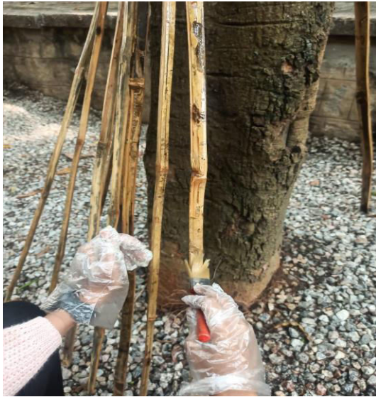
Fig. 1. Epoxy coating