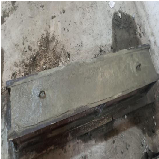
Fig.3. (a) Casted Beam