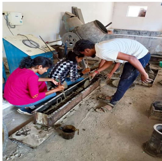
Fig.3. (b) Casting of beam