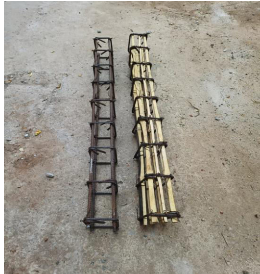
Fig. 2. Steel and Bamboo Reinforcement cage