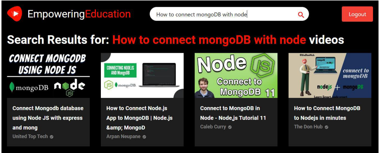
FIG 5: SEARCHES RESULT