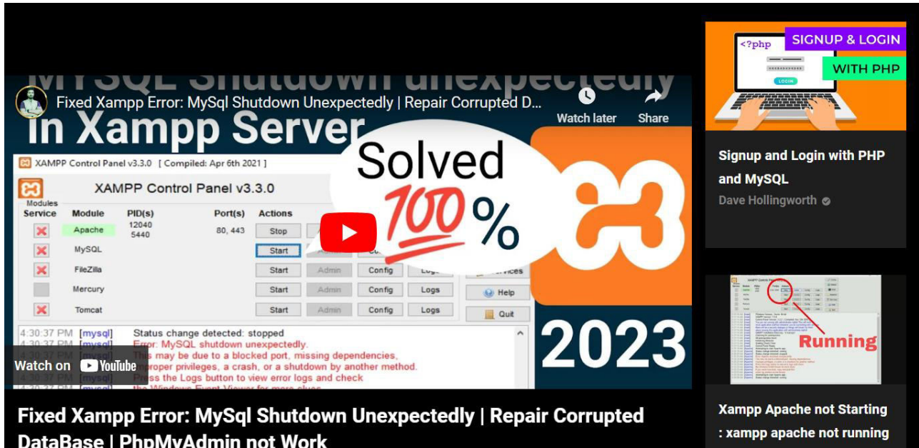
FIG 8: VIDEO RECOMMENDATION RIGHT SIDEBAR