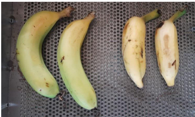
Figure 2: Initial state of fruits on Day1

Result: After 3 days, it was observed that the fruits in the cooling cabinet had ripened less than the fruit stored outside. From this experiment we can infer that the perishables can be stored longer in the cooling cabinet.