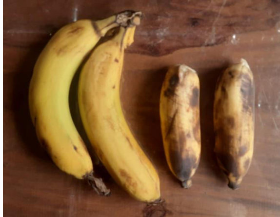
Figure 4: State of fruits kept outside on Day3