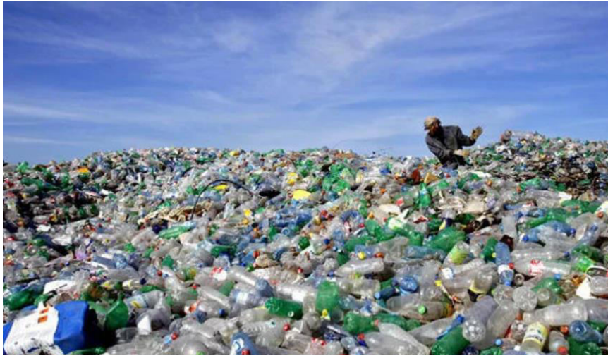
Figure 5. Waste plastic

Preparation of samples: There will be a total of four marshall stability samples created, three of which will include plastic waste in varied percentages, such as 5%, 10%, and 15%, while the last sample will not contain any plastic waste.