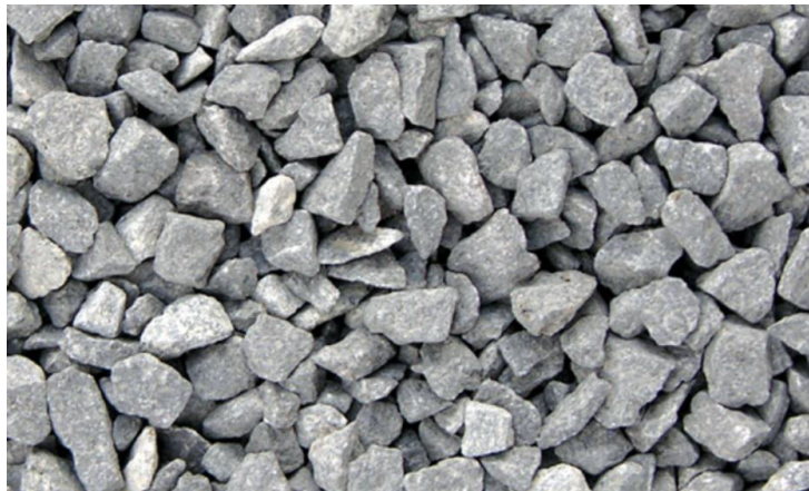
Figure 3. Aggregate

When it comes to the creation of flexible pavement, aggregate is one of the most significant materials employed. Hot mix asphalt pavements are formed by combining bitumen with aggregate that has been carefully chosen and graded before being mixed together. The primary components of hot mix asphalt pavements that are responsible for sustaining loads are aggregates. They are classified as coarse aggregate if they remain on a sieve with a size of 2.36 millimeters, fine aggregate if they pass through a sieve with a size of 2.36 millimeters but still remain on a sieve with a size of 0.075 millimeters, and mineral filler if they pass through a sieve with a size of 0.075 millimeters. Figure 3 depicts the aggregate as shown below.