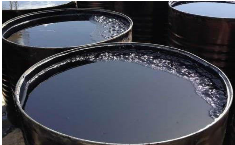
Figure 4. Bitumen

It is common knowledge that bitumen functions as the asphalt building material known as the binders as shown in Figure 4. It is one of the most essential components used in the building of highways. It is the significant binding feature of bitumen, which becomes softened when heated, which has made bitumen a popular choice as a material for binding. This is exactly has made bitumen so popular.