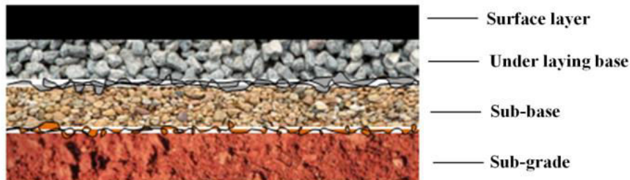
Figure 1. Cross section of the layer of flexible pavement

Roads, parking lots, railway lines, port runways, and airport runways are all examples of places that often use conventional flexible pavement. It is possible for it to be made up of several layers, such as the surface layer, the underlying base, the sub-base courses, and the sub-grade layer (Figure 1), but this will depend on the purpose and the required level of strength. The surface layer is composed of aggregates and asphalt, which is also known as bitumen. Bitumen is a sticky, black, very viscous liquid or semi-solid form of petroleum that is capable of severe plastic deformation due to its viscous nature [1]. The majority of asphalt surfaces are constructed on top of a gravel foundation, although there are other surfaces that are constructed entirely straight on the sub-grade.