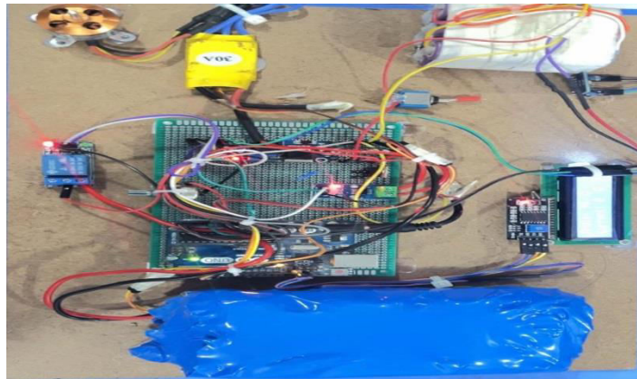
Fig 2: During ON condition

The integration of gyroscope sensors proved highly effective in detecting uphill driving scenarios, swiftly activating the relay for super capacitor engagement. This rapid response ensured seamless power augmentation during uphill climbs, significantly improving power performance. Real-time monitoring revealed a notable enhancement in power delivery metrics, attributed to the efficient utilization of the super capacitor to support the main battery. The dynamic power management strategy, coupled with predictive control algorithms, optimized energy distribution, further bolstering performance and efficiency. Additionally, the gyroscope-based control system enhanced stability and traction control, yielding smoother driving experiences. Reliability testing affirmed the system's robustness, underlining its potential for real-world deployment in diverse terrain conditions