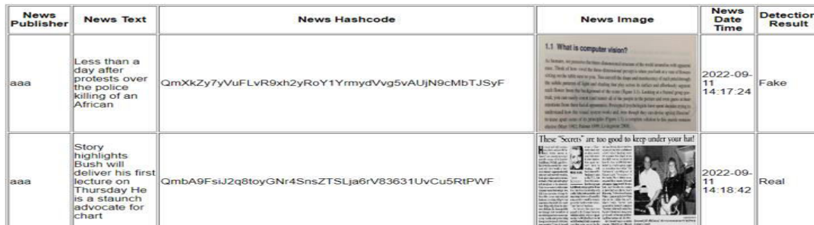
Table 2: publish news