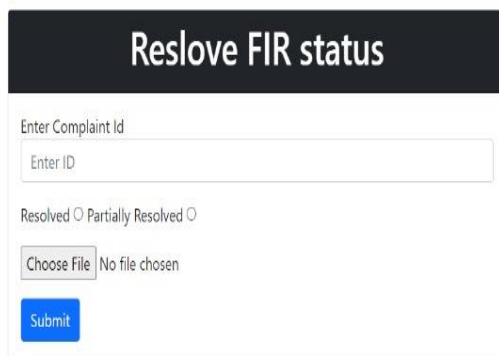
Figure 5 : Resolve FIR status for Secure Complaint Filing and Management System.

From figure 5, The "Resolve FIR Status" page stands as a pivotal feature within the Secure Complaint Filing, Tracking, and Management System using Blockchain Technology. This interface provides authorized personnel with a streamlined platform to update the status of registered complaints, particularly those concerning First Information Reports (FIRs). Users are prompted to input the unique identifier associated with the complaint, ensuring precise identification for resolution. Through the selection options of "Resolved or Partially Resolved," users can accurately indicate the current status of the complaint, distinguishing between fully resolved and partially resolved cases. Upon inputting the necessary details, clicking the "Submit" button initiates the secure recording of the status change onto the blockchain. By leveraging blockchain technology, the system maintains an immutable record of status updates, ensuring transparency and accountability throughout the complaint resolution process. This intuitive interface not only facilitates efficient status updates but also enhances stakeholders' trust in the system's reliability and effectiveness.