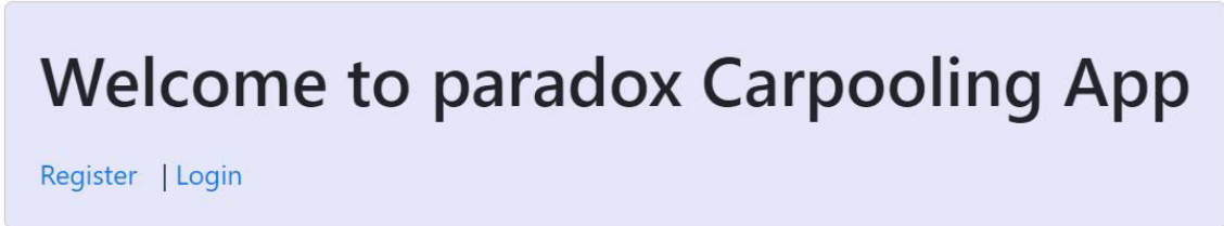
FIG 1:Main Page