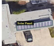
Fig : Solar Panel Detection

Image Processing: Utilize image processing techniques to detect and extract features indicative of solar PV panels from the satellite imagery.