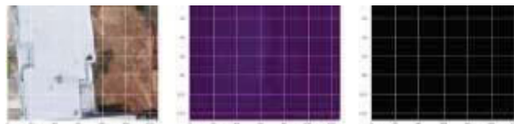
Fig : Absence of Solar Panels

Integration: Integrate the trained models into the system for automated detection of solar PV panels in the satellite imagery.