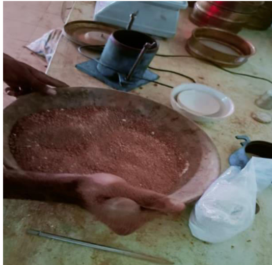
Fig 2: Chemical fixation

The technique of chemical fixation applies reagents or chemicals to the polluted soil that interacts with heavy metals and forms low toxic substances that are insoluble or hardly mobile. Such solid types of heavy metals could then not migrate to water, plants or any other environmental media, thereby completing the remediation process. This method is effective for soil with low contaminant concentrations. Conditioning agents used in the method include clay, metallic oxides and biomaterials, but these agents can affect the soil structure to some degree and can also have an adverse impact on the soil microbes.