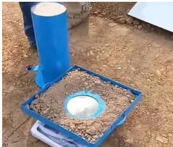
Fig 1: Soil replacement

The system of soil replacement uses clean soil to completely or partially replace polluted metal soil. It is also referred to as the ‘dig and haul’ process. The key aim is to reduce the concentration of pollutants and increase the soil's natural potential, thus remediating the soil. This technique is very laborious, costly and only appropriate for smaller areas that are heavily polluted. Again, it is split into three types, namely soil substitution, soil spading and soil importing. Soil substitution is the process in which the polluted soil is removed and fresh soil is kept in its place. This approach is only