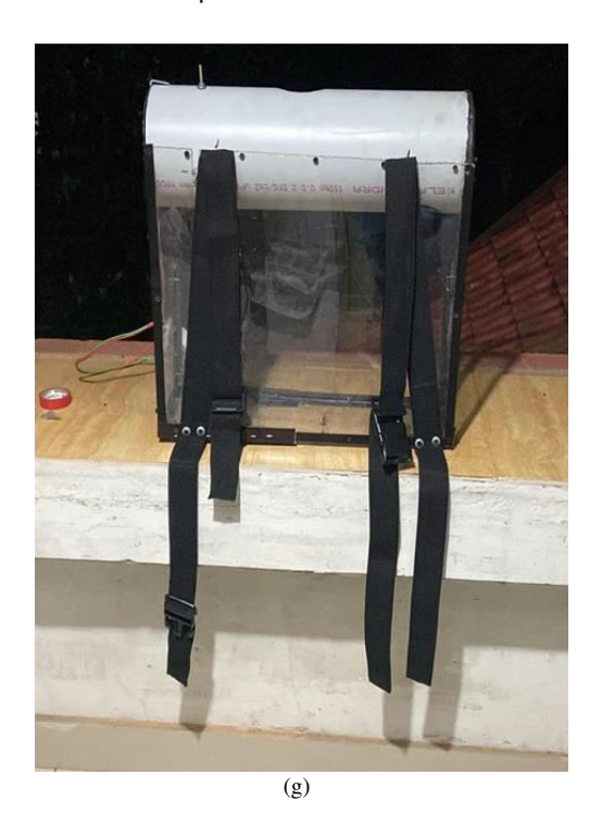
(f),(g) Finished Model Of Collection Unit Using Polycarbonate

In ordinary harvesting method a person should climb up the tree to pluck the pepper. By using black pepper harvesting equipment pepper at heights can be easily pluckedfrom the ground. Due to the built-in threshing mechanism the an extra step in the process of pepper harvesting can be reduced.