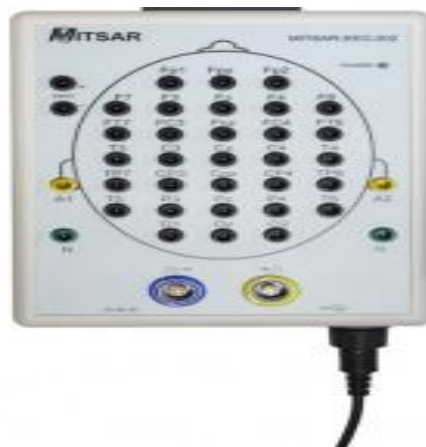
Figure.5(Mitsar 202 24 Channel)