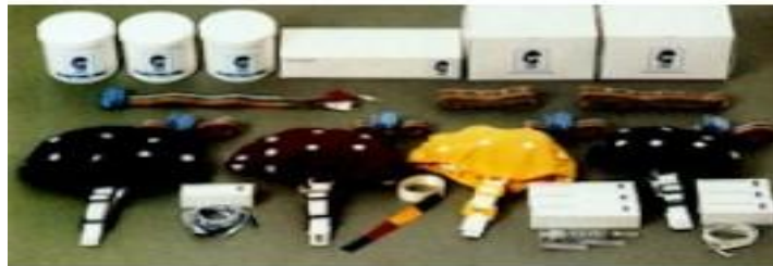
Figure.2 (Electro Cap System III)