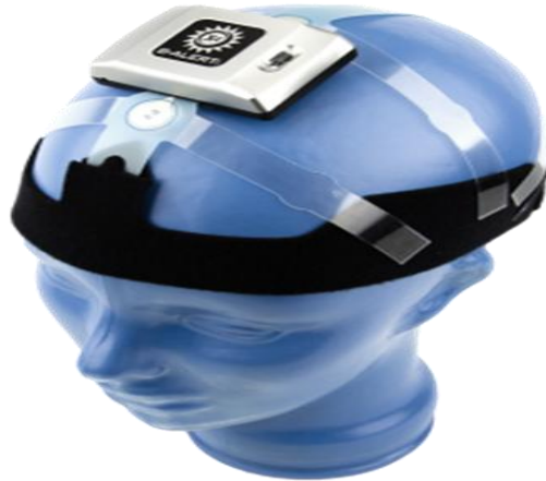
Figure.4(B-Alert X4 – Wireless EEG Headset System)