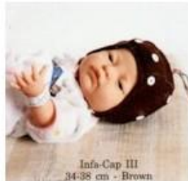
Figure.3 (Infa-Cap III)