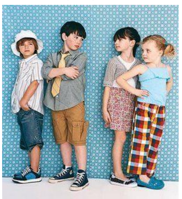
Fig.1. Gender visualization

Child marriage robs girls of their childhood as they step into adult roles that they are unprepared for - be it managing households, bearing children, making decisions and so on. It not only hampers her schooling but also pushes young girls into early pregnancy which harms the health and nutrition of the teenage mother as well as her child.