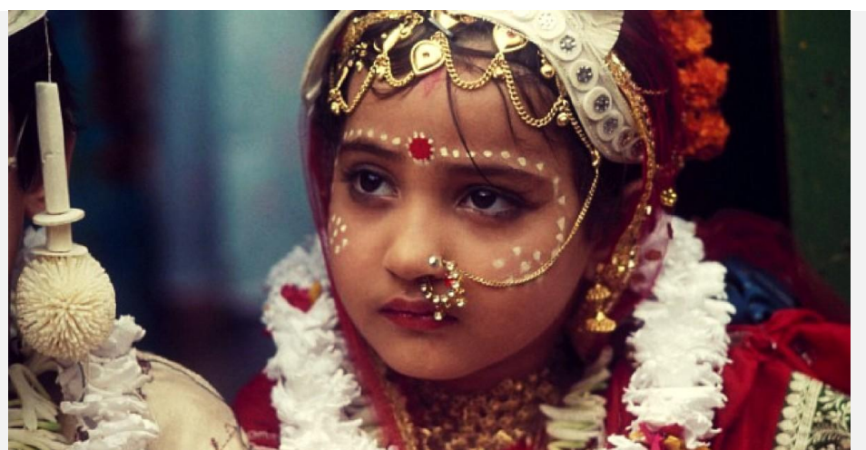
Fig.3: Championing the cause of Girls, Every single day

Gender Studies is an interdisciplinary area which cuts across caste, class faith and location. It is basic to the construction of knowledge and is a critical marker of social transformation. This emerging area incorporates methods and approaches from a wide range of disciplines, yet unifying them through a critical angle of vision. Gender should become an important organizing principle of the national and state curriculum frameworks and their transaction.[9]