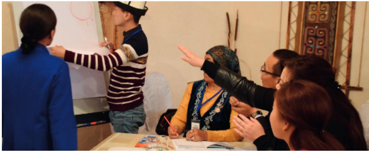
Fig.5: Gender Action Learning Process

Gender at Work has honed a Gender Action-Learning process (GAL) to address women's rights and gender equality within civil society organisations, international organizations and other development institutions.