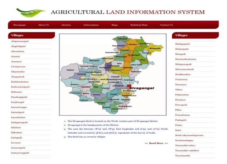
Fig 3: ALIS Sivagangai Block Village Information

The user can view the cadastral map of any village in the block by just clicking on the name or the sitemap. It contains the name of the all 51 villages in the sivagangai block.