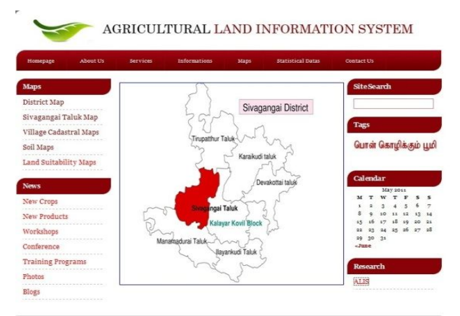
Fig 2: ALIS Sivagangai District Home Page

The user can view the cadastral map of any village in the block by just clicking on the name or the sitemap. It contains the name of the all 51 villages in the sivagangai block.