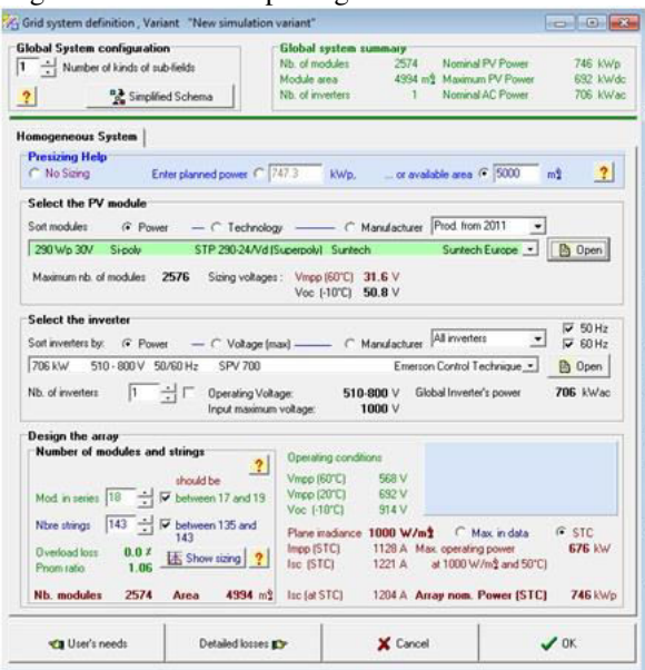
Fig. 2 System Specification generated using PVsyst Software.

By using the PVsyst version 6.2.4 it is possible to have preliminary and as well as post evaluation test data for the feasible power generation. The total system performance and efficiency of each systems of plant are evaluated by entering the make and specifications of a particular plant design. In this paper the main parameter is to concentrate on average energy output by comparing with the software package.