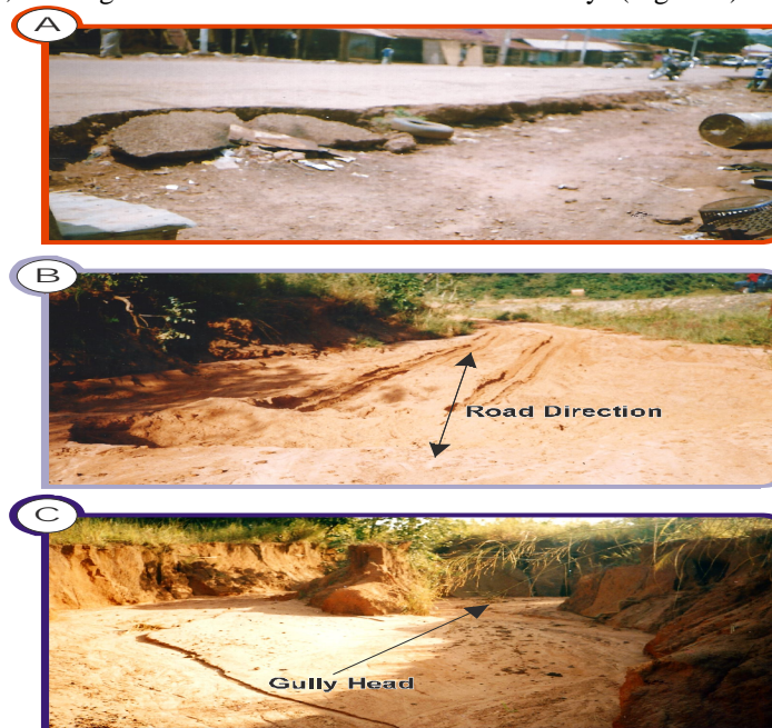
Figure 1: Some Land Devastations Caused by Soil Erosion on the IAP (A) An urban roadway undermined by soil erosion at Dekina. (B) An intercity roadway overtaken by eroded sediments between Otukpa and Orokam. (C) A portion of a landscape degraded by gully erosion at Ankpa.

Ankpa. Also many urban drainage structures, electricity and telephone structures, high-value buildings, and highway roadside drains and culverts have been lost to gully erosion at Otukpa, Ankpa, Ayangba, Dekina, Ogwulawo, Ofu and Idah. In addition, in the rural areas, gullies have dissected and voided farmlands, caused the disappearance of village water supply sources, and degraded inter-and intra-communal roadways (Figure 1).