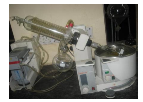
Fig. 5. Rotary evaporation process