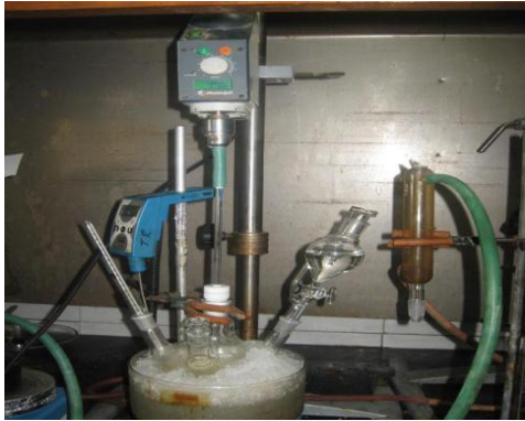
Fig.2. Epoxidation process

The epoxidation of rapeseed oil is carried out in batch type glass reactor consisting of a four necked round bottom flask of 500ml capacity. A motor driven speed regulator stirrer inserted in the reactor through the central neck while the other neck was used for inserting thermometer. A reflux condenser was fitted to the reactor through the third neck and the fourth neck is used for dropping the raw materials into the reactor via dropping funnel. The reactor was heated by an electric heating mantle having an arrangement for accurate control of the temperature within \pm 1^{\circ} C of the desired temperature. A photographic view of the experimental setup for the epoxidation reaction is illustrated in Fig. 2.