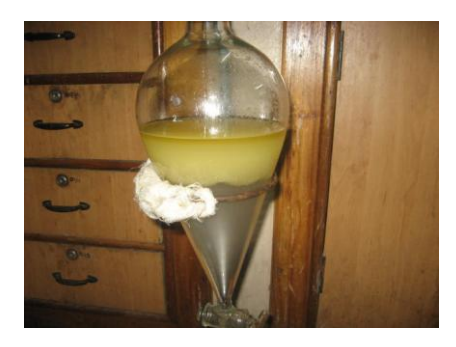
Fig.4. Separation process

by using magnetic stirrer. The product of the reaction was cooled and decanted to effect a separation of the epoxidized oil from water phase. The epoxidized oil was then washed with warm water in small aliquots to remove residual contaminants.