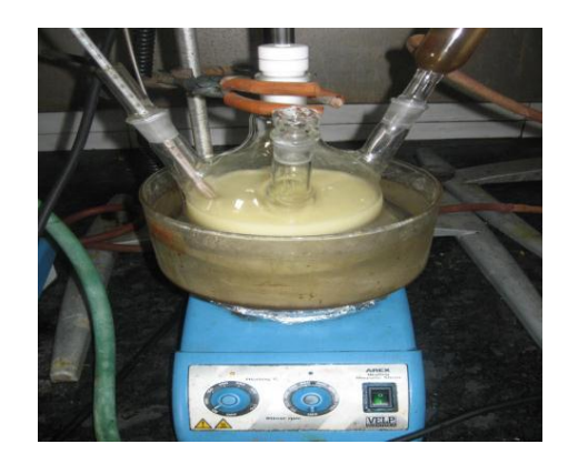
Fig3. Epoxidation process

Prior to the epoxidation reaction, rapeseed oil was analysed to determine its iodine value. Rapeseed oil of 326 ml, 0.3253 mol. was placed in the 500ml four necked round bottom flask. Formic acid of 31.4 ml, 0.813 mol at a molar ratio of 0.75:1 to the oil and 0.358ml, 1 wt% of sulphuric acid catalyst was added to the contents were mixed by means of a stirrer and it was maintained at 0 -10°C with the help of an ice bath. Then 30 wt. % hydrogen peroxide of 265.72 ml, 2.603mol was added drop wise to the reaction mixture at a rate such that the hydrogen peroxide addition was completed over 15 minutes. This feeding strategy was required to avoid the overheating the system as the epoxidation reaction is highly exothermic. Further the contents were well mixed and were performed at a stirring speed of 300 rpm. The temperature is then raised slowly to 55-60°C by keeping four necked flask in hot water bath as shown in Fig. 3 and maintained at same temperature