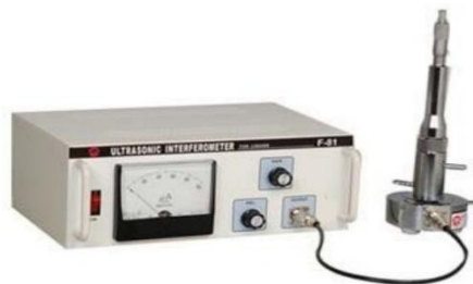
Figure 1: Experimental setup of ultrasonic interferometer.