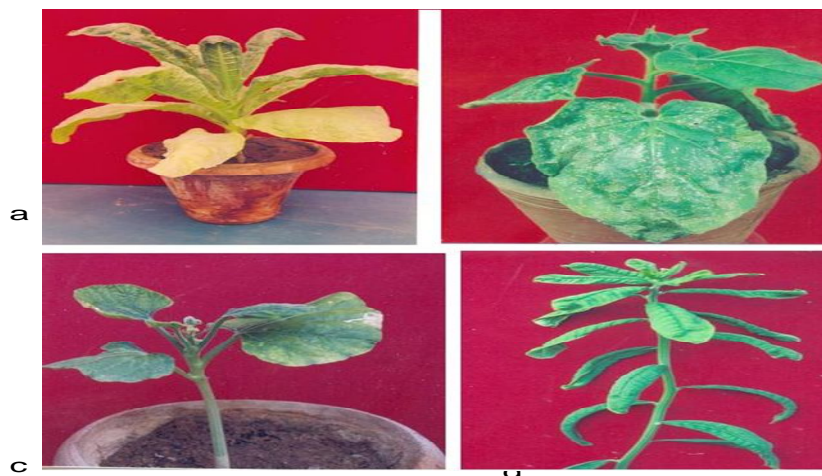
Fig.2 Plants showing viral symptoms: a: Systemic symptoms of TMV on Nicotiana tabacum cv. NP-31; b: Localized symptoms of TMV on Nicotiana glutinosa ; c: Systemic symptoms of CMV on Lagenaria d: Systemic symptoms of SRV on Crotalaria juncea

Plants showing viral symptoms on a & b -tobacco, c- Lagenaria and d-sun hemp Fig-1 is expressed in the experiment. The disease was apparent from the first week onwards in all the beds of okra, however in the third week disease spread stabilized in the treated beds. Between 4 th and 5 th week control beds exhibited a steep rise in disease and number of plants infected shot up from 20% to 35%-40%, indicating perhaps a fresh vector attack which had no effect on the treated beds Fig-2.