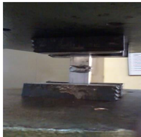
Fig. 1. Tensile testing in UTM