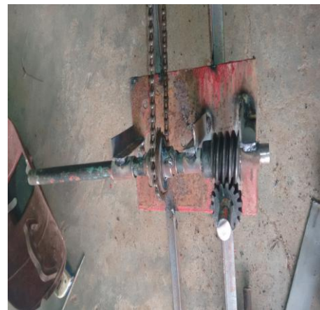
Fig.7 Drive system – chain type