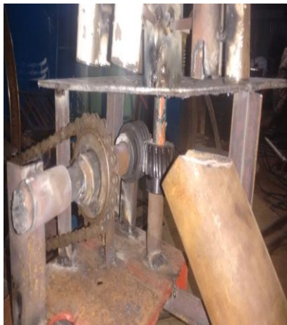
Fig.6 Drive system