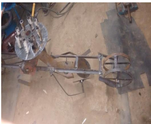
Fig.5 Experimental Setup- aerial view