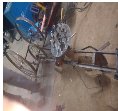
Fig.6 Experimental Setup-eagle view