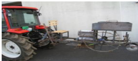
Fig. 3 NCAM-developed prototype cassava stem planter.

Planting is majorly being carried out manually (i.e. using cutlass to lift the soil and insert the stem to about 10 cm into the soil and cutting off the rest from the buried stem). Mechanical planters available in the country are not yet fully developed to a level for them to be taken up by fabricators for commercialization. The National Centre for Agricultural Mechanization (NCAM) has in recent times made an in-road into the development of a mechanical planter which is about 75% completed. The conclusion on planting is that there is yet no commercially available mechanical planter for cassava planting in Nigeria (9). The NCAM-developed prototype cassava stem planter and in operation is shown in fig.3