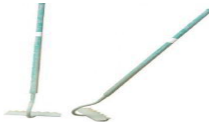
Fig.4 NCAM-developed long Handle hoe

Cassava is susceptible to early weed competition [6]. Slow initial development of sprouts from cassava cuttings makes all cassava cultivars susceptible to weed interference during the first three to four months after planting. In recent times, NCAM was able to come up with a long-handle hoe which is a better hand hoe than the traditional method being utilized. The long-handle hoe eliminates the bending posture required by the traditional hand hoe method (7).