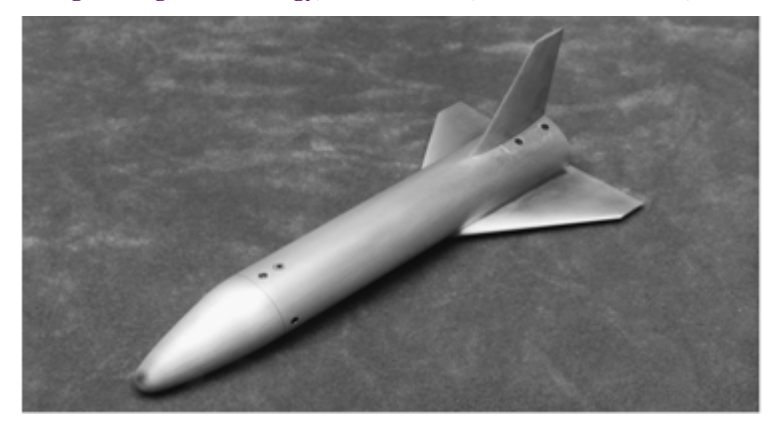
Figure 3: Wing-Body-Tail Configuration

Sri Krishna College of Engineering & Technology, Kuniamuthur, Coimbatore-641008, Tamilnadu, India