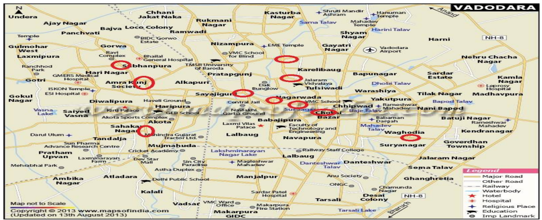
Figure 2 Traffic Junctions