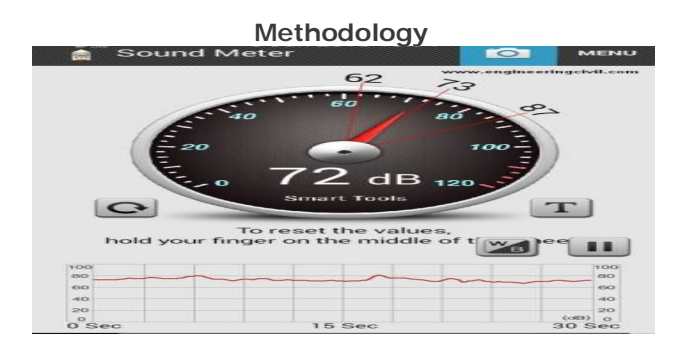
Figure 1 Sound Level Meter Lite

At lower traffic speeds (typically less than 60km/hr), engine and exhaust noise tend to dominate. Tyre noise is a component of vehicle noise which significantly increases with speed. Studies suggest that at speeds between 30 and 50 km/hr, tyre noise of cars increases to a level which dominates the overall vehicle noise. For trucks, this 'cross-over' point tends to occur between 40 and 80 km/hr.