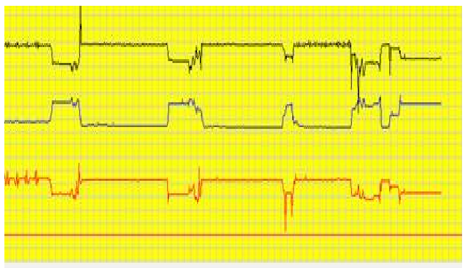
Fig.3: Abnormal vaibration of electrical machine

Hence, both the figures represents the vibrations that are measured on the motor. Fig (2) represents the normal vibrations of the machine whereas fig (3) respresents the abnormal vibrations of the machines.