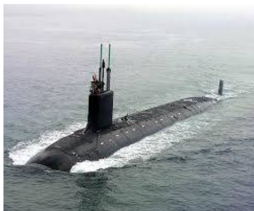
Figure 2: Submarine based multifunction of mast mounted antennas

Second type of antenna which is the towed buoy or “swimming fish” antenna. It can be used for underwater reception of HF, MF, LF and VLF signals. The towed buoy antenna consists of a buoyant, stream lined, submersible housing, which contains a very sensitive Omni directional antenna. The disadvantage of this “towed buoy” antenna is limited frequency range of reception and cannot be used for transmission. For suppose if it is used for transmission, it requires a very powerful transmitters. Third type of antenna is the multifunction of mast mounted antenna. It is used to carry information by raising the antenna above the surface of the Submarine. The multifunction of mast mounted antenna is needed for high speed connectivity with Satellites, air and surface orbits as well as land stations. This mast consists of various antennas and provides the RF Communication for the Submarine to cover the VLF, MF/HF, VHF, UHF frequency bands with GPS and IFF functions. To improve the performance of the various antennas, located in the Submarine mast, the bandwidth has to increase their antennas to support multiple RF frequency bands or the Gain has to increase their antennas to support high data rates. The following figure2 shows the Submarine based multifunction of mast mounted antennas