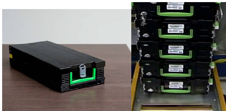
Figure: 03; the S2 Media Dispense Module

The present system has oblivion of keeping the more number of Indian rupees for the withdrawing demands as well as to keep storing currency. The S2 Media Dispense Module is available across all new Self-Serve 20, 30 and 90 series ATMs.