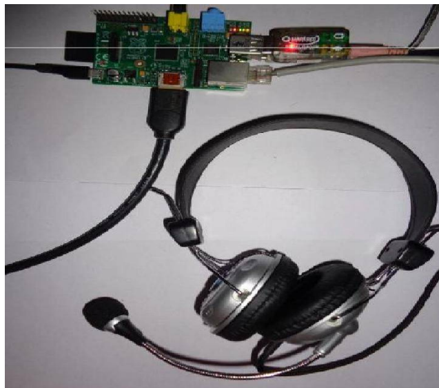
Figure 2: Experimental setup: The above given setup shows the experimental model. Raspberry pi 1 has the Microphone connected on its A/V slot. Ethernet cable and power supply are plugged to it on their respective slots. SD card which has the Raspbian image written to it has also been fixed im its slot.

The Implementation process achieves speech to text by using Raspberry pi and Raspbian image installed on raspberry pi. This is the basic step to understand the commands of linux for converting speech to text conversion. The Raspberry Pi is an ultra-low-cost, deck-of-cards sized Linux computer. It is controlled by a modified version of Debian Linux optimized for the ARM architecture. It has two models model A and model B. The Model B has 512 MB RAM, BCM2385 ARM11, 700 MHz System on chip processor. It has 2 USB ports, HDMI out, audio output jack and Ethernet port for internet access and the USB sound card is neede8d to interface with pi model because it has only audio output jack and so by using sound card we can input voice data into pi.