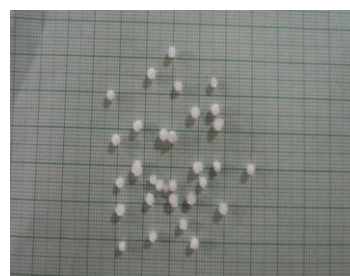
Figure 1(a): Growing crystals within the test tube Figure 1(b): Grown crystals of shiny white colour having spherulitic morphology

The powdered sample of grown crystals was studied by powder X-ray diffractometer and the results were analyzed. The experimental 2\theta range is 3^\circ – 90^\circ with a step size of 0.05^\circ and a counting time of 60s per step. The program of graphic tool for powder diffraction named Win-PLOTR package [37] is used to determine the observed diffraction peak positions of the crystal. Analytical indexing of the powder pattern and determination of the space group are performed using EXPO 2009 [38-39], which is designed to launch the most common indexing programs.